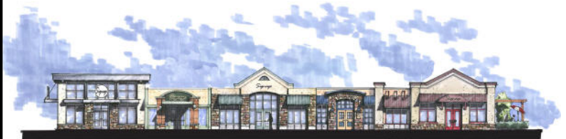
Restaurant with Drive-Thru 1,750 SF Lease Space 1,685 SF Lease Space 2,000 SF Lease Space 1,685 SF Restaurant 2,500 SF